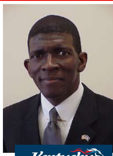
Kentucky UNBROKEN SPIRIT Cabinet for Economic Development

When: Tuesday, December 2nd, 2008 Where: Bluegrass Area Development Center, 699 Perimeter Drive, Lexington KY Time: Doors open for networking at 6:30pm, Meeting begins at 7:00pm